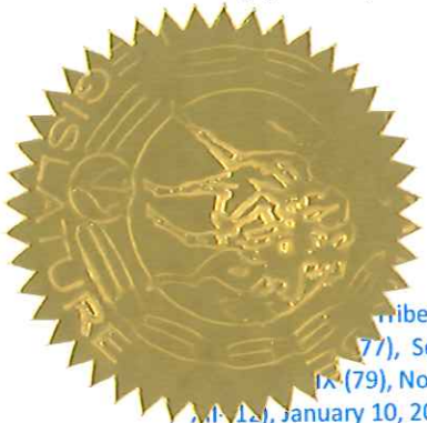
Anita Johnson Secretary of the Legislature

The foregoing Resolution KL-CY-2024-002 was duly voted upon by the Legislature on January 13, 2024, at a Legislative Regular Session LXXXI (81), with a vote of (6) in favor and (0) opposed, (0) abstaining, and (1) absent, according to the authority vested in the Legislature by the Constitution of the Kiowa Tribe.